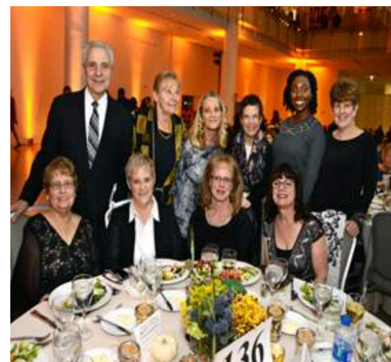
Lambs Farm staff and guests at dinner

They will forever cherish the wonderful memories from their many hours of volunteering. Both women believe that the world would be a better place if all people were like our Participants.