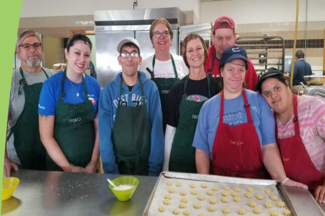
Volunteers from Astellas and Bakery Employees preparing Famous Butter Cookies