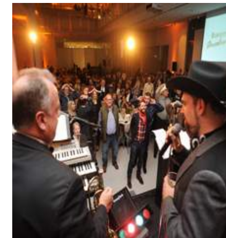
Guests on the dance floor

A heartfelt thank you to everyone who attended and supported our Annual Benefit. The generous sponsors and donors play a vital role in the event, and make a huge impact on the lives of the men and women of Lambs Farm.