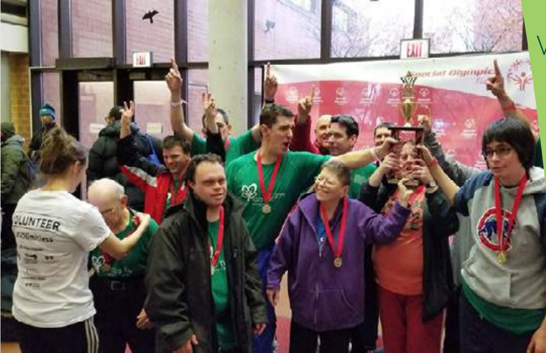
The Floor Hockey Team with their trophy